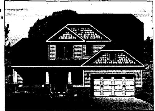
The Willows is bringing an "old-fashioned" neighborhood feel back to new construction offerings in Wallingford.

This exceptional 3,300 square foot custom Colonial is under construction in Milford's Morningside Association. The dramatic open floor plan features oak floors, fireplace, custom kitchen, detailed trim, central air, 2 car garage and two decks. Four bedrooms and 3.5 baths include a dramatic master suite with vaulted ceilings and his and hers walk in